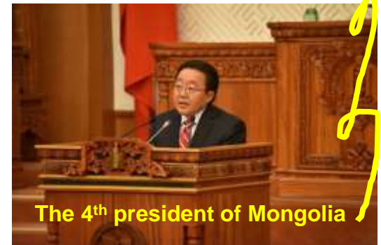
The 4 th president of Mongolia