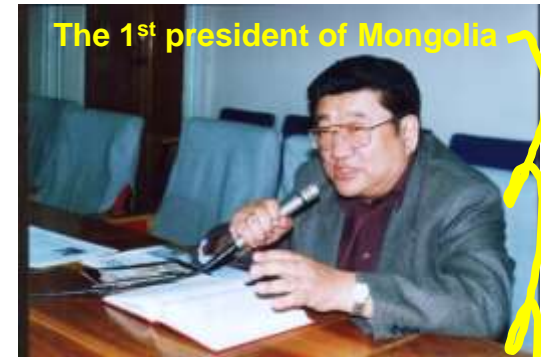
The 1 st president of Mongolia